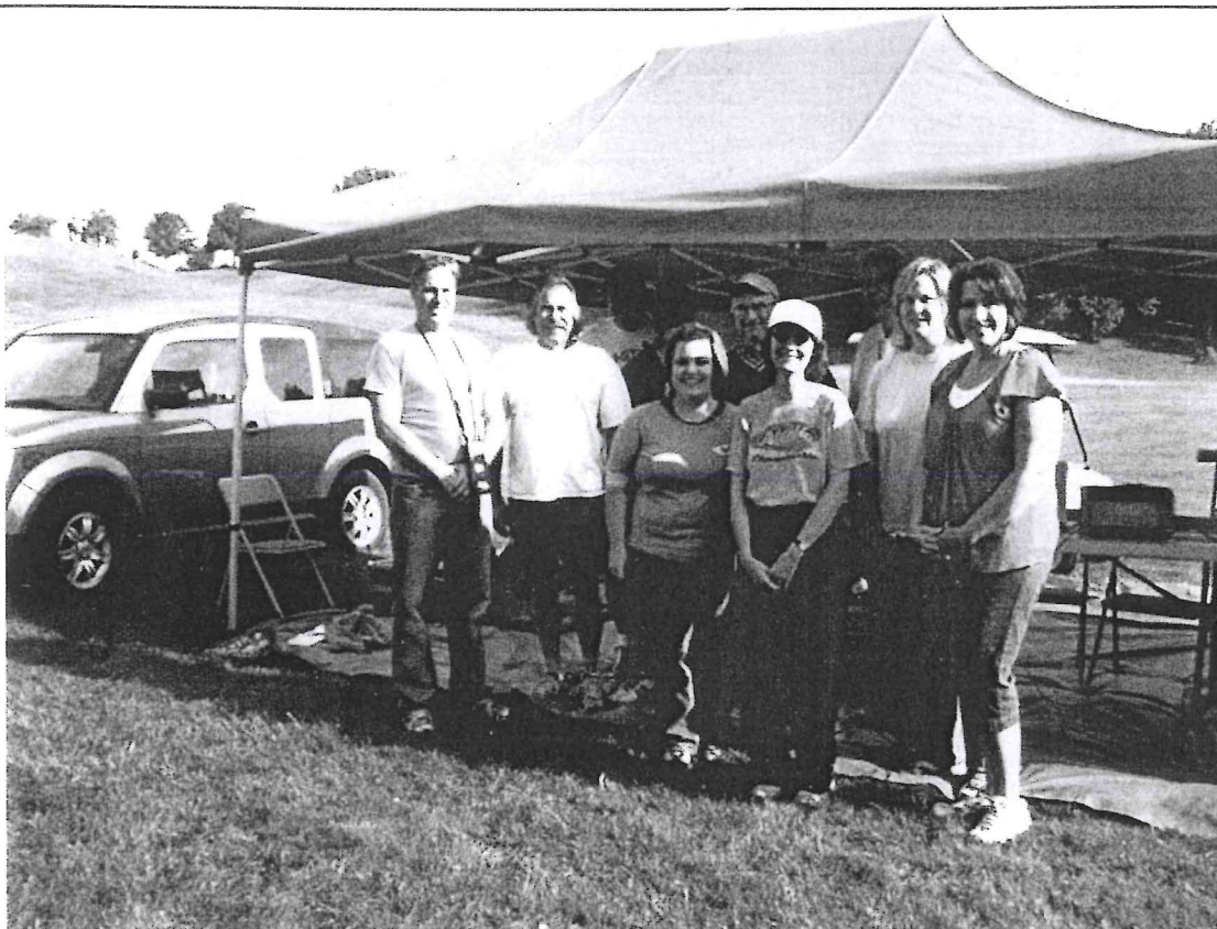
Pictured are parent volunteers who are standing in front of Geneseo's new United Center team tent.