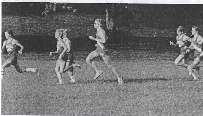
Stride for Stride, Geneseo Runners always come out on top.