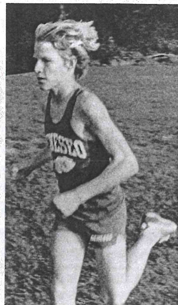
Where'd everyone go?