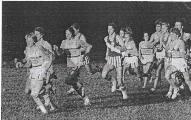
Geneseo runners lead the pack.