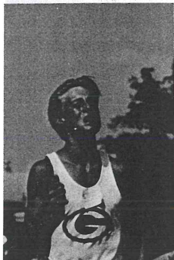
Last Stretch for Home.