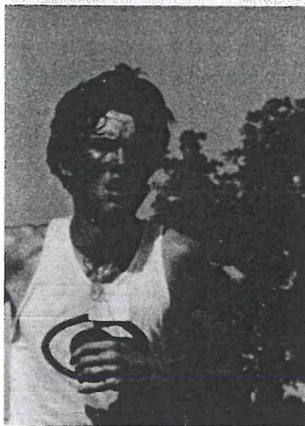
Concentrating on the race.