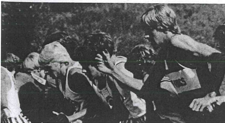
Determined to get ahead.