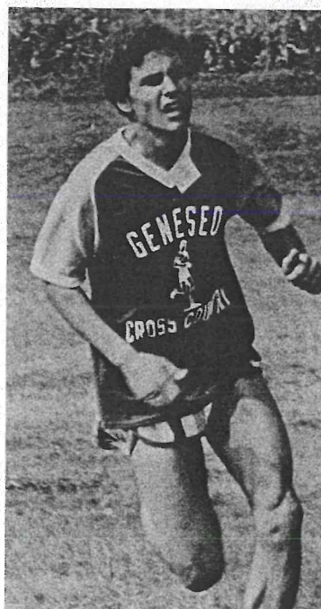
Finish line, here I come!