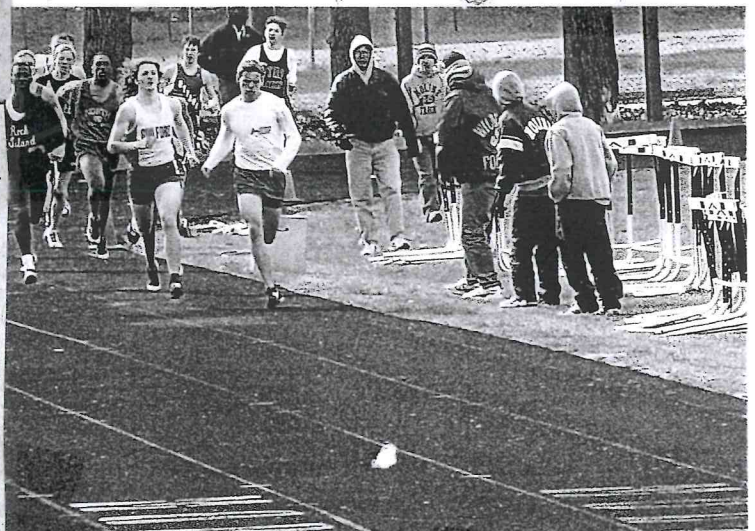
Shipley Invite 1st lap 1st place