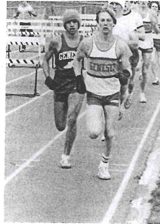
Follow the leader?