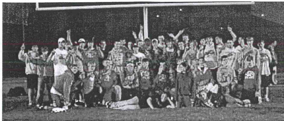
Leafs Capture NCIC Gold and End Dixon's 6-Year Reign

► Favorite to win: It should be 12 in a row by late afternoon on Saturday for Rock Island. United Township, the last team other than the Rocks to win conference, is probably the next best team, and Quincy is reputed to have a lot of talent back from last year's tournament runnerup team.